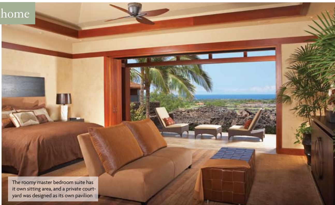
The roomy master bedroom suite has its own sitting area, and a private courtyard was designed as its own pavilion

inch screen that drops down from the ceiling. Two negative-edge pools are perfect for lounging to watch whales cavort in the Pacific.