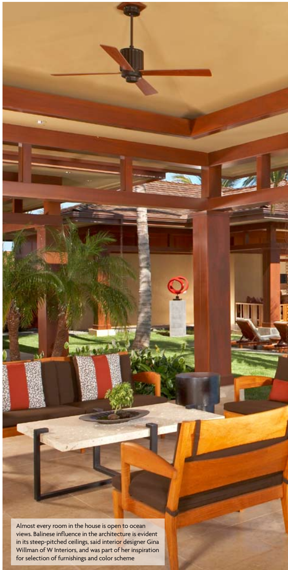
Almost every room in the house is open to ocean views. Balinese influence in the architecture is evident in its steep-pitched ceilings, said interior designer Gina Willman of W Interiors, and was part of her inspiration for selection of furnishings and color scheme

The Hawaiian-style beauty's spacious, yet cozy, 10,251 square feet of living space includes a main area of great room, dining room, outdoor dining lanai and glammed-up kitchen with state-of-the-art Sub-Zero, Viking and Fisher/Paykel appliances. Bedroom suites each have their own courtyard entrance, with two suites connected by a sitting room with a wet bar. The master bedroom suite was designed as its own pavilion, with a walk-in closet, sitting area and private courtyard. Bathrooms in all suites feature walk-in showers and lush outdoor shower gardens. A home office with powder room can be converted to guest quarters, as can a media room, with surround-sound audio and a 110-